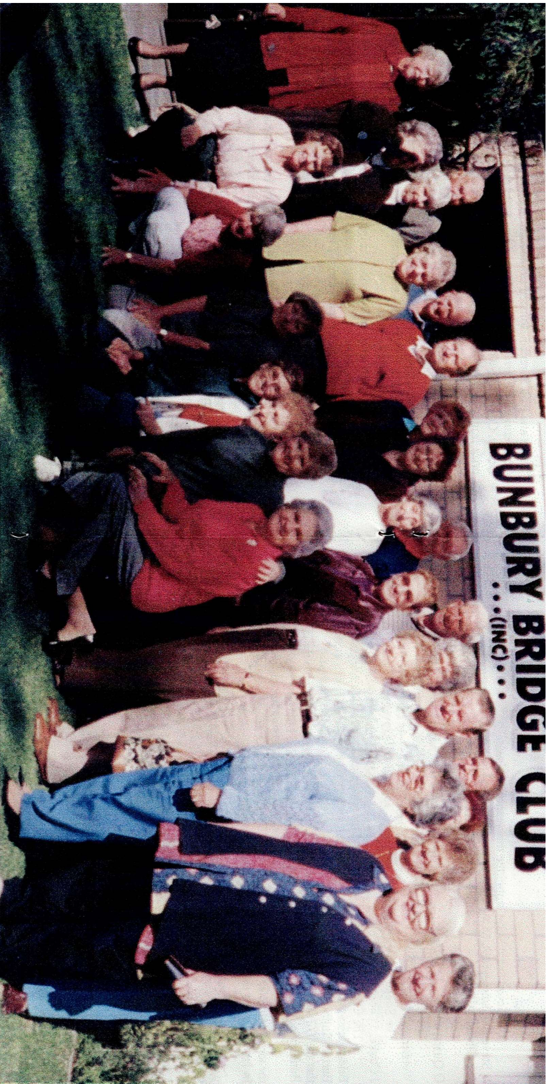
Some of the Bridge Club Members outside Balgore Way Club House